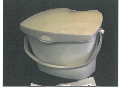
Sure Close Kitchen Composter

We are also selling two types of bins for the kitchen for $10.00. The Busch Kitchen Composter has a filter for eliminating odors and has a capacity of 1.3 gallons. The Sure Close Kitchen Composter has a capacity of 1.9 gallons. Both can be used to store food scraps in the kitchen until you can take them to your composter.