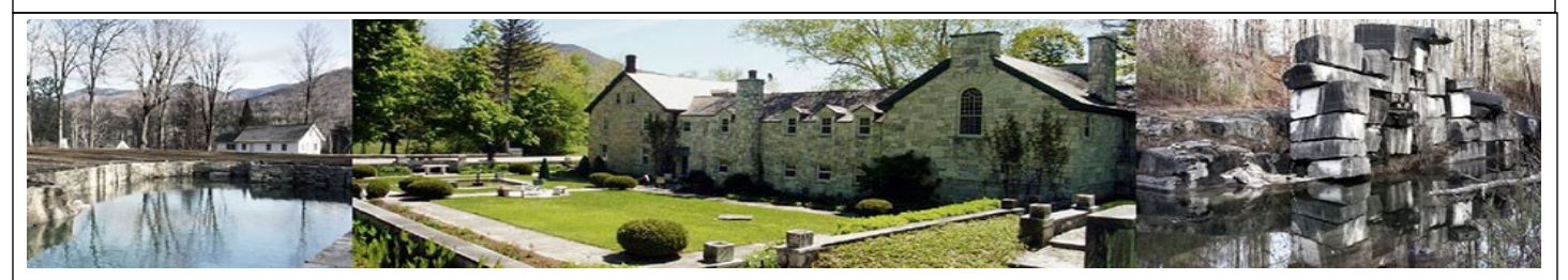
The Quarry and ART-Seed

LOCATION: Marble House Project, 1161 Dorset West Road, Dorset, Vermont 05251