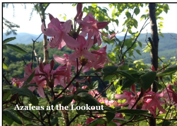
Azaleas at the Lookout