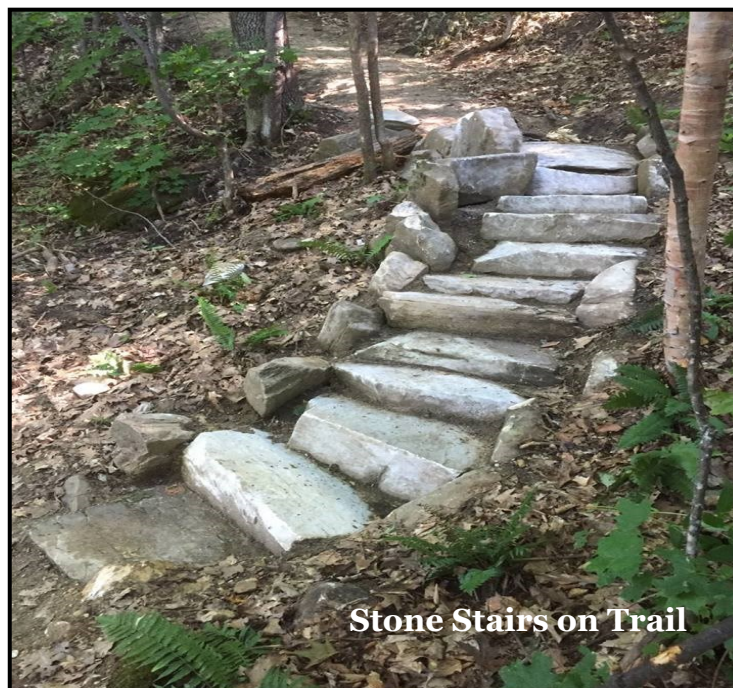
Stone Stairs on Trail