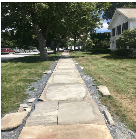
Church Street Sidewalk Project 2019