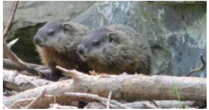
Woodchucks in Dorset Hollow