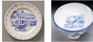
Plate: 10" blue and white plate with a picture of the Bley House. Bowl: one-of-a-kind 6" x 16" blue and white bowl with scenes of Dorset.

All proceeds will benefit educational programing at DHS